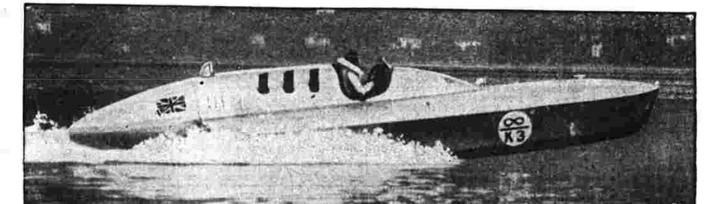
THE SWISS NAVY is a myth, but Sir Malcolm Campbell, famed auto racing driver and holder of the world's speed record on land utilized the lake at Loranore to test a new speed boat. He is shown here trying for a record. Although he reached a top speed estimated at 140 miles an hour, a cooling system failure halted his quest temporarily.

CHINA'S WALL in modern times is not of stone, but of barbed wire, as constructed by the Japanese. These Japanese soldiers, stripped to the waist under a blazing North China sun, fence a corridor. But it's wire for war and not to keep cattle from getting away in the fields.