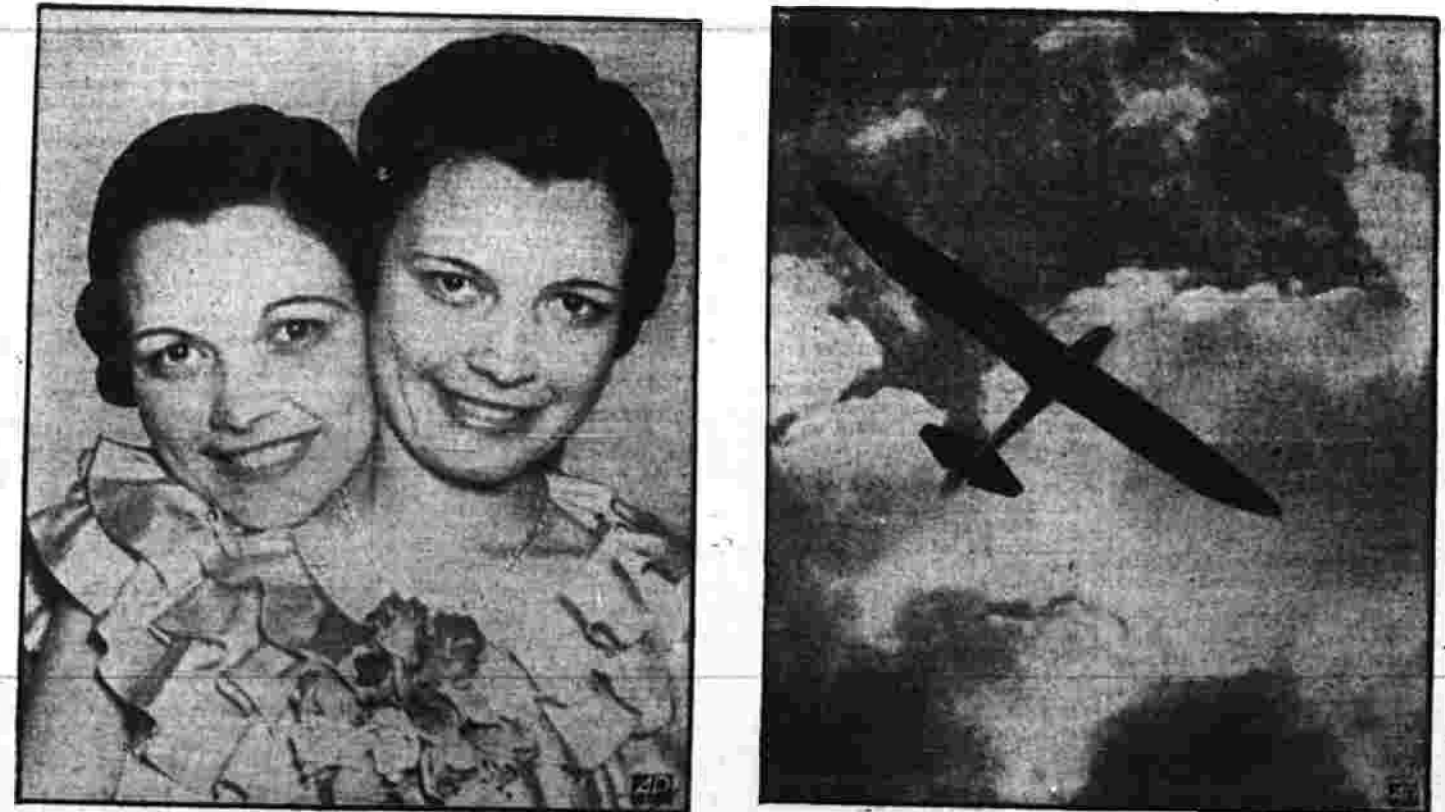
COASTING ON AIR is rapidly becoming a popular sport in England and other European countries. This group of a glider hovering in a clouded sky was taken at the first Anglo-German gliding camp, where meeting competitors held this year at Fk Wayne, Indiana.